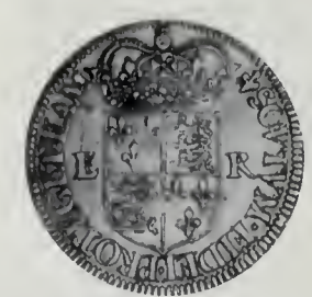
Lot No. 2839

Milled Coinage (1561-1570). Half Pound. Obv. Crowned bust in elaborate dress, no inner circles. Rv. Crowned Armorial flanked by E and R. S.2543. There are a few surface marks and the planchet is a bit uneven. Lightly cleaned. Otherwise Very Fine. (2,500-3,000)